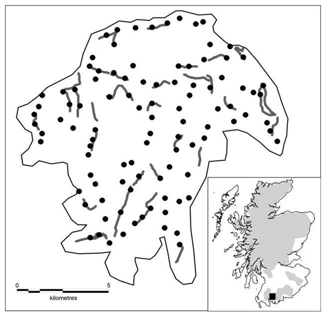
Fig. 1 Location of the study area ( black square ) and pine marten distribution ( grey shaded ) in Scotland (inset). Location of hair tubes ( black circles ) and scat transects ( grey lines ) within the study area

2010). A total of 100 hair tubes were placed at a density of one tube per 1 km<sup>2</sup> Ordnance Survey grid square throughout the study area, with approximately 1 km spacing between each tube where practicable (see Fig. 1). Grid squares that had less than 50 % forest cover and those without vehicle tracks for easy access were excluded. Hair tubes were installed within 10 m of the forest track and were fixed vertically to the trunk of a tree using wire, approximately 1 m off the ground. Two patches of 'mouse glue' (Pest Control Supermarket, http:// www.pestcontrolsupermarket.com) cut to 1 cm × 1.4 cm rectangles and stuck with double-sided sticky tape to blocks of 4-mm thick Correx Board measuring 2 cm × 2.5 cm were fitted to the base of the tube to catch hair when an animal entered. Tubes were baited with chicken meat attached to the inside of the tube lid with wire or string. Four sampling sessions were conducted, with tubes sampled between 5 and 9 days apart over a total of 32 days. During each sampling session, any glue patches that had collected a hair sample were removed and placed in a plastic sample pot, labelled with a unique sample number and subsequently frozen at -4 °C within 12 h of collection. Fresh glue patches were fitted and fresh bait was installed in the tube on each occasion when patches were removed.